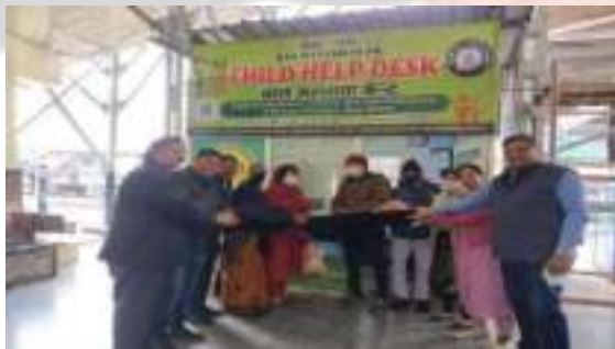
Donate Blanket for child rogram