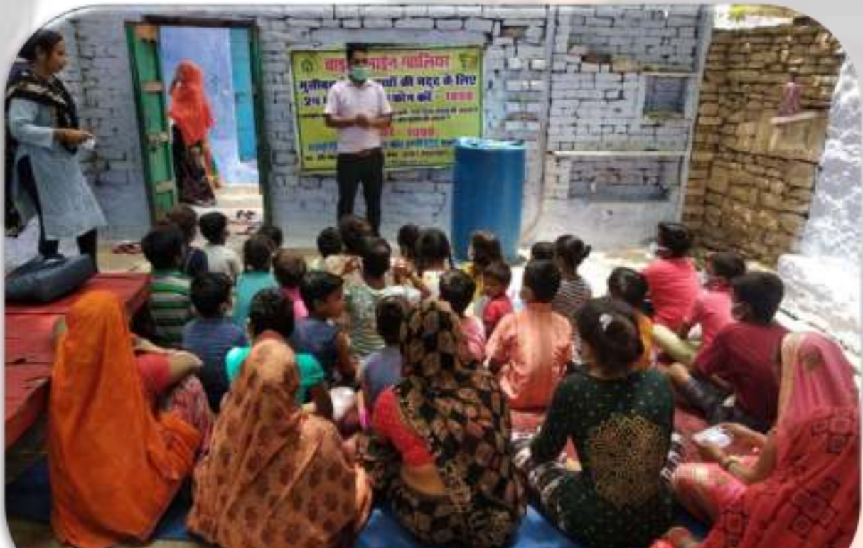
Child Line Se Dosti Program in Shelter Home