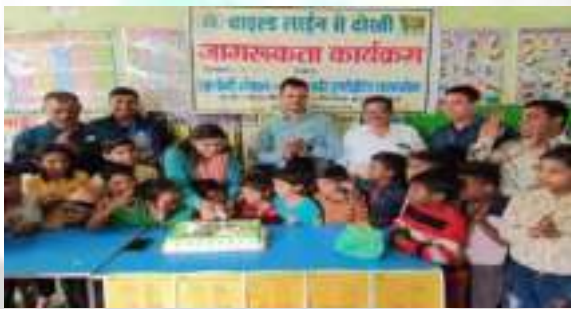
Open shelter home program