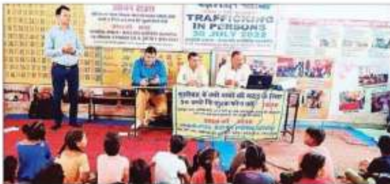
श्रीराम एक्सप्रेस, ज्वालियर