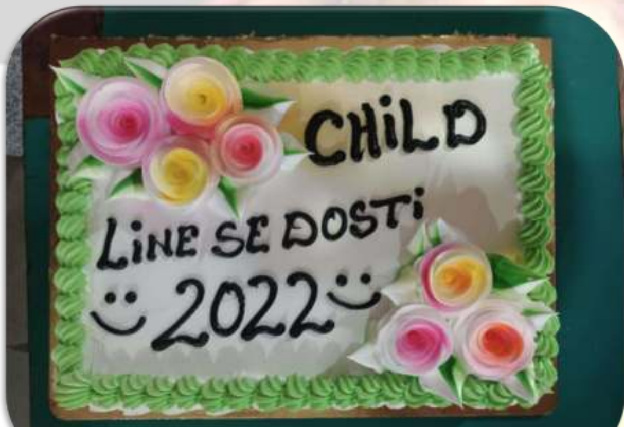
Child Line Se Dosti Program in Shelter Home