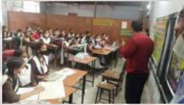
Orientation in Railway school Gwalior