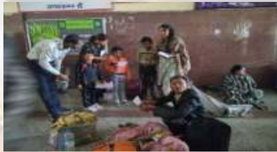
Passenger awareness program