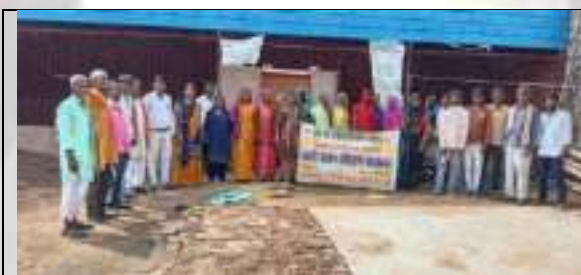
Capacity building on goat rearing