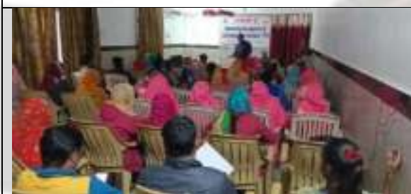
Capacity building of FPO members on market linkages