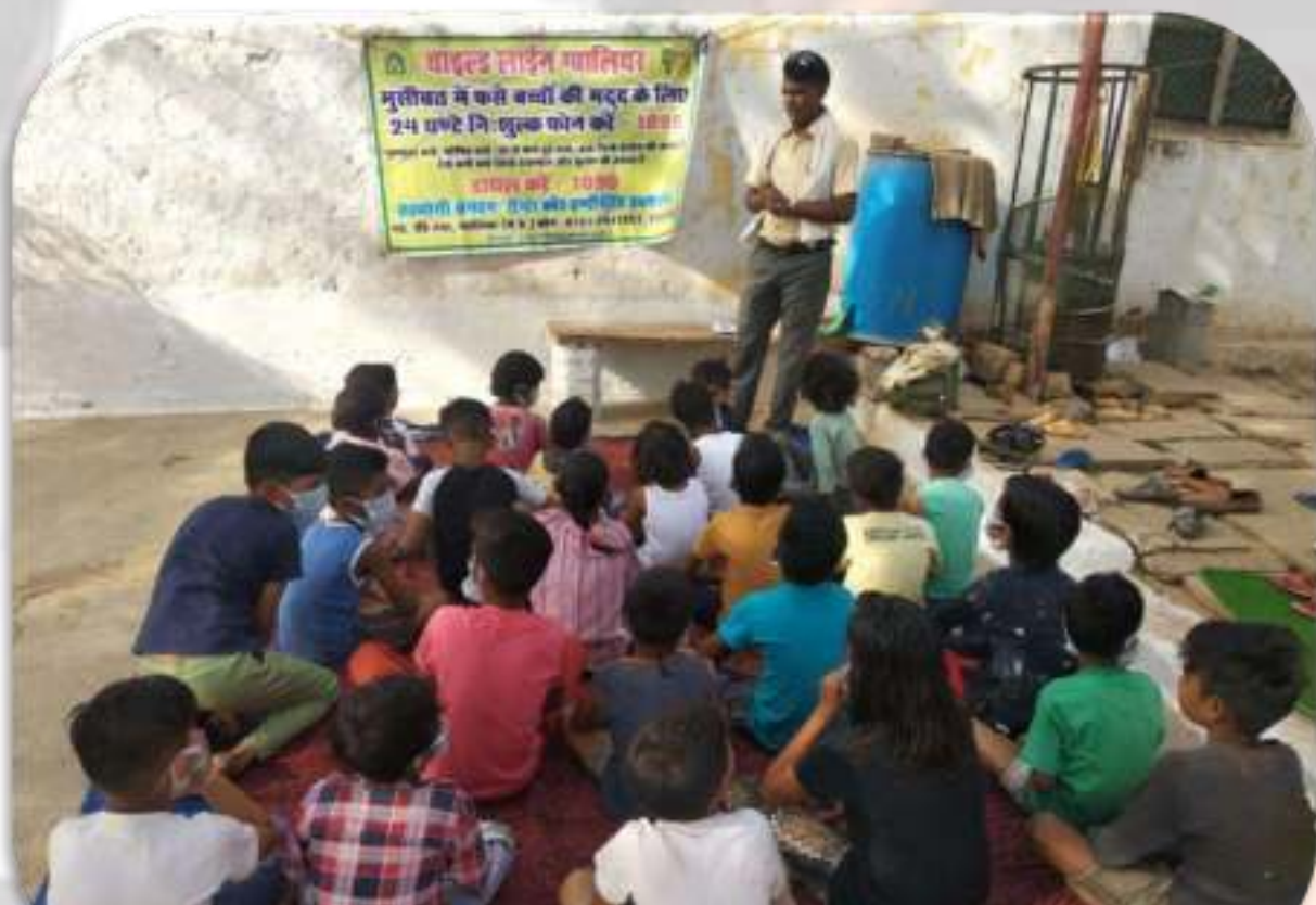
Child Line Se Dosti Program in Shelter Home