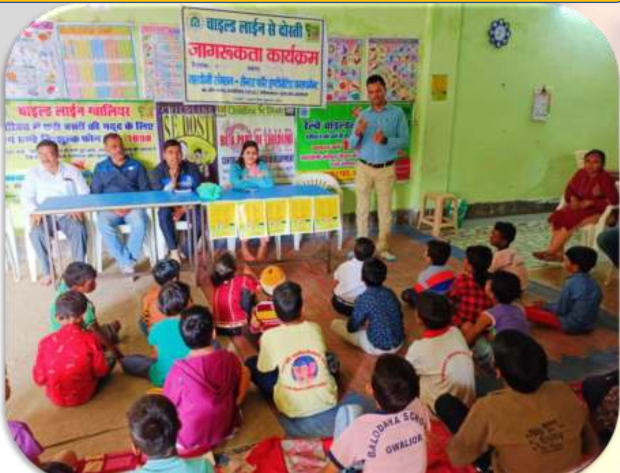
Child Line Se Dosti Program in Shelter Home