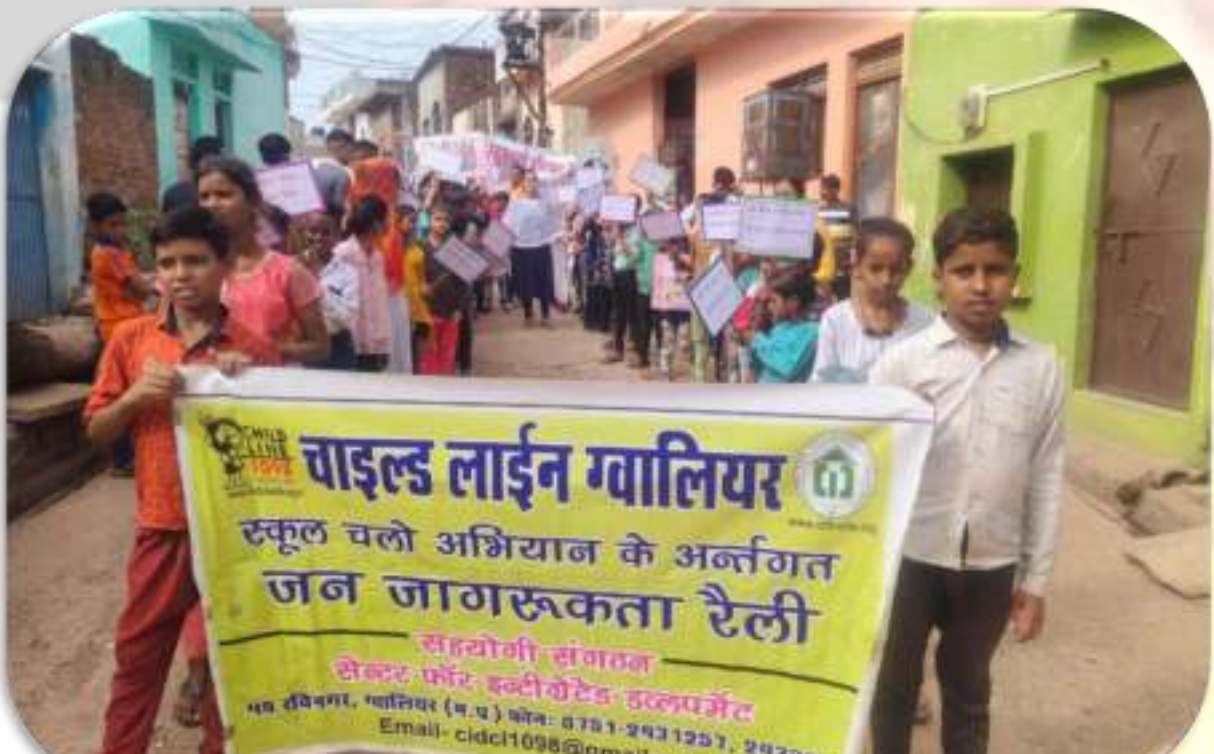
Rally on School Going Program