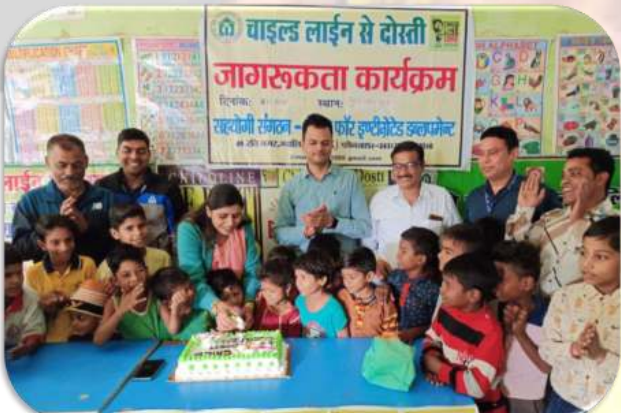
Child Line Se Dosti Program in Shelter Home