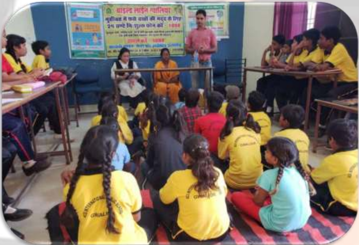
School Orientation Program