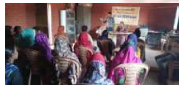
Capacity building on goat rearing