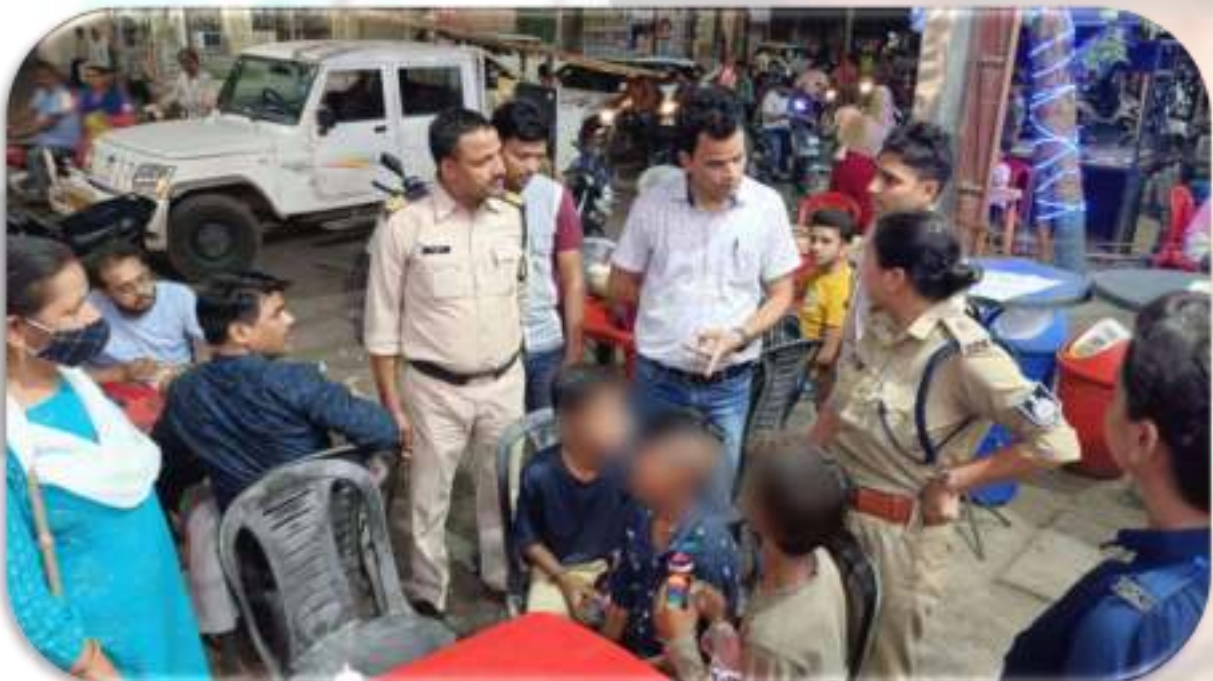
Child Labor Rescue Operation with Police Department

Team extended all support, and the girl is living well. Legal intervention is going on by police.