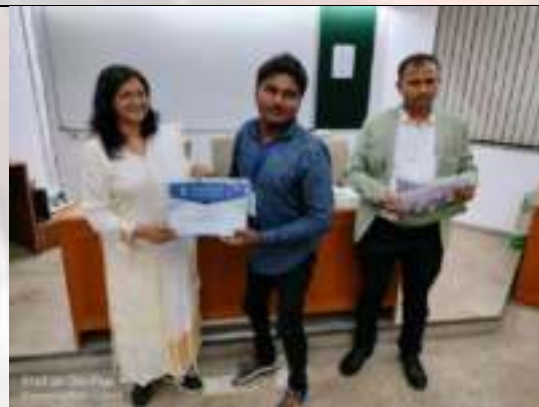
Capacity building of board members on FPO at BIRD Lucknow