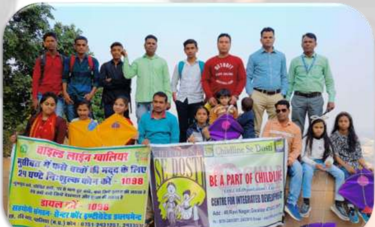
Kite Flying Program under Child Line Se Dosti Program in Shelter Home