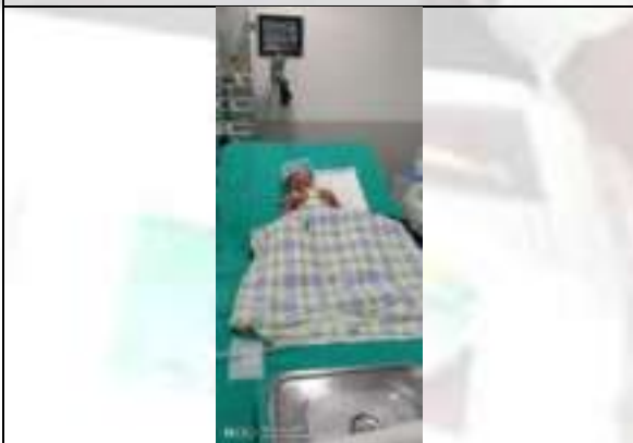
Rehabilitation services provided through project intervention