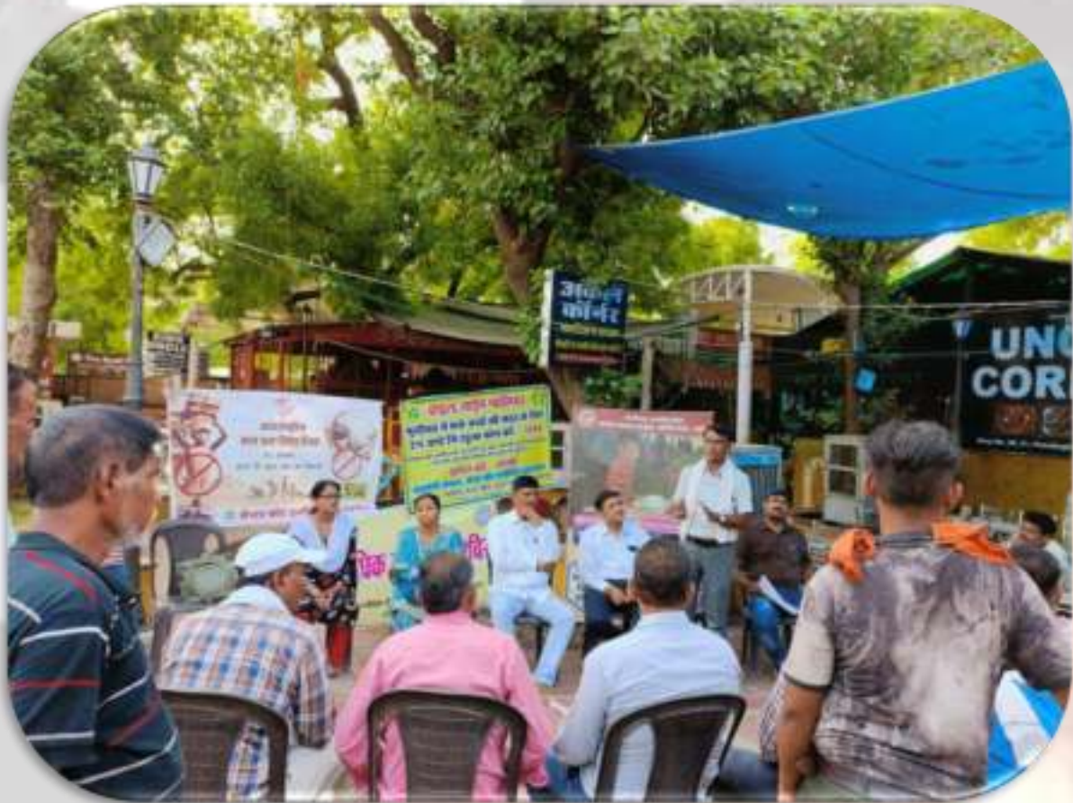
Awareness of Child Labor Issue with Labor Department