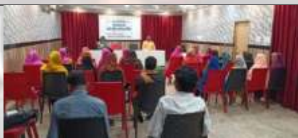
Capacity building of FPO board members