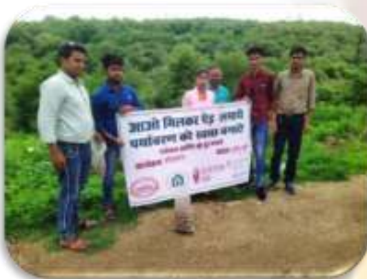
Plantation and Seed Ball Throwing Event Photographs