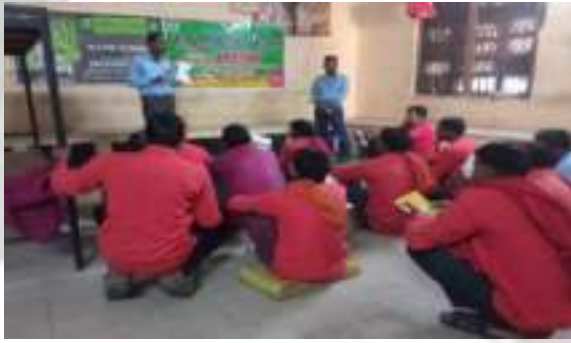
Coolie orientation program