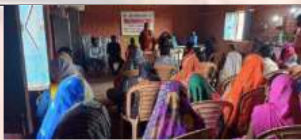
Celebration of International day for persons with disabilities